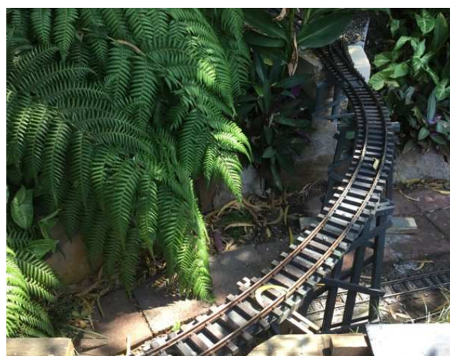
The track deviating to left goes to Coal Loader. The track that veers right is to Devil's Pinch.

This bridge and the Coal Loader Junction allow passage to the Hells Gate Colliery Coal Loader then on to the Hells Gate Junction, Passing Loop Junction, Hammock Junction and Spiral Junction that directs trains down to Sundial Loop. That same turnout point at Skink Bridge also directs trains running back to Devil's Pinch, Summit of the Spiral, Purgatory Scrub, Hammock Junction, Hells Gate Junction, Mosquito Flats, Possum Bend then back to the points that start this deviation. This creates a circuit that allows continuous running.