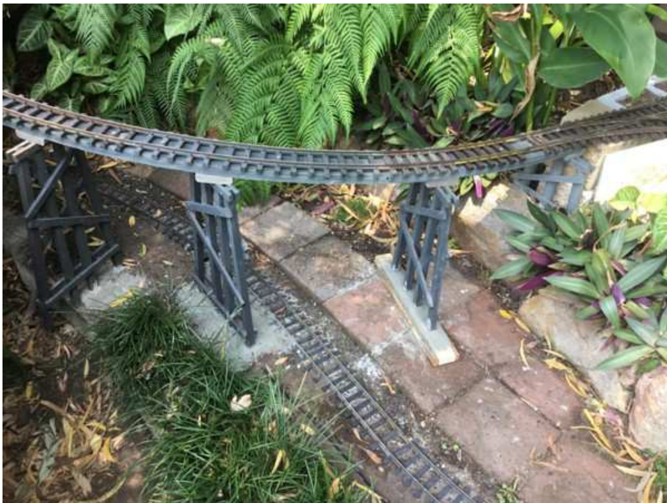
The unusual arrangement at the middle bent which is set parallel to the track under the bridge.